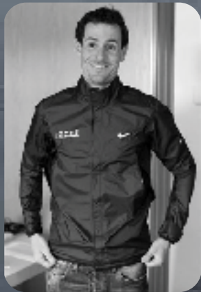
Andres Kloden Team Radio Shack