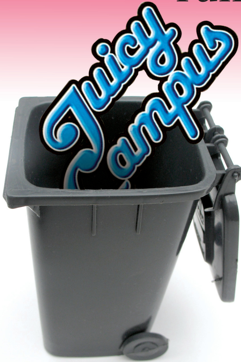
ILLUSTRATION BY SAM STONE