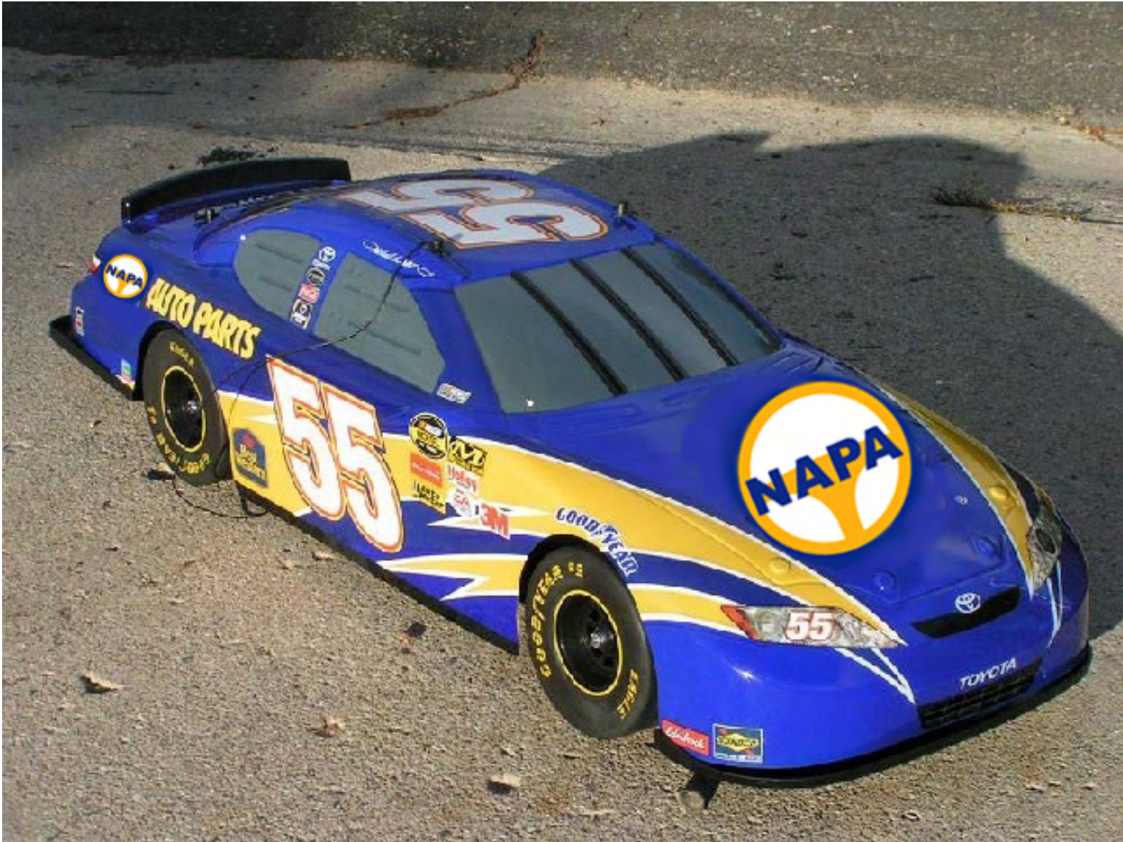
This is how the logo would look like on one of NAPA's sponsor cars.