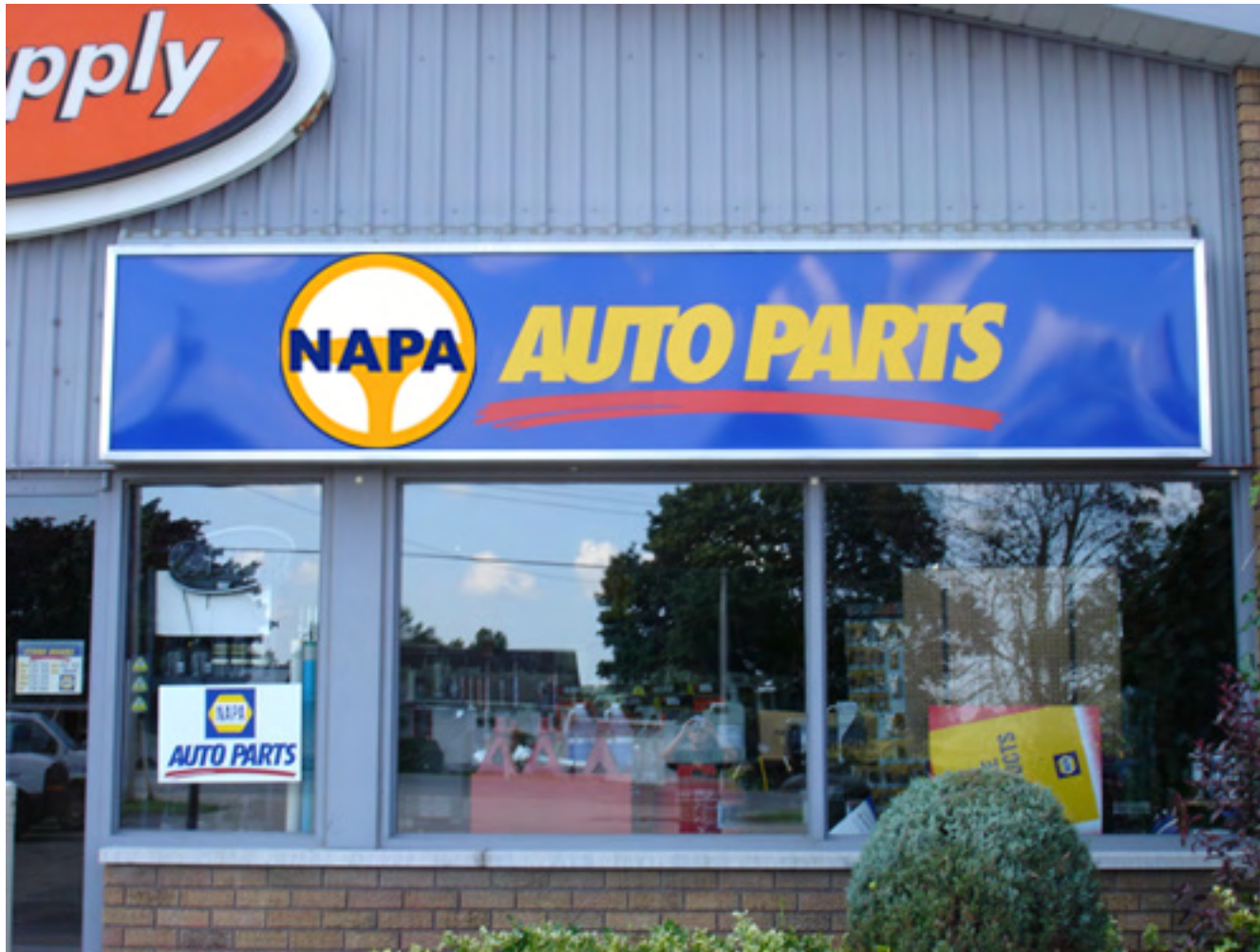
This is how the logo would look like on the sign of a local NAPA store.