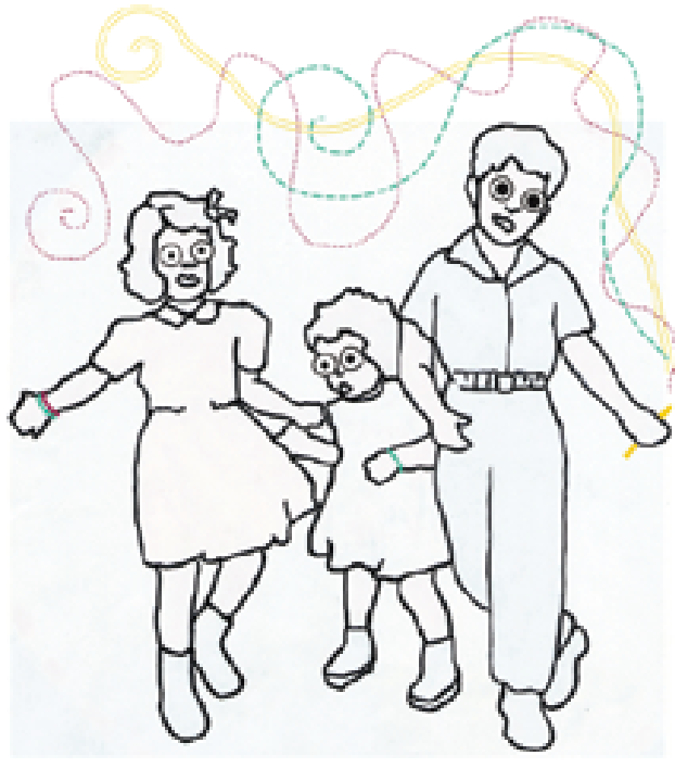
Illustration: [Name] | Photo: [Name] | Year: 2007