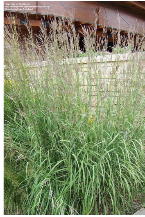
BIG BLUESTEM (ANDROPOGON GORARDII)