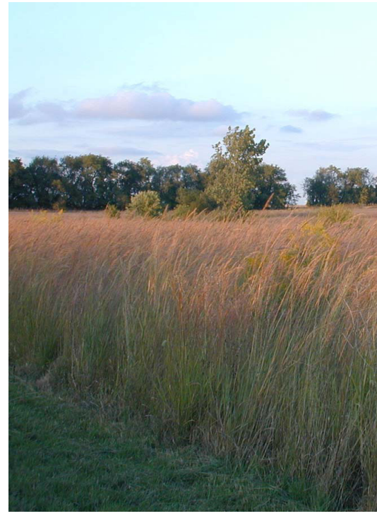
INDIAN GRASS (SORGHASTRUM NUTANS)