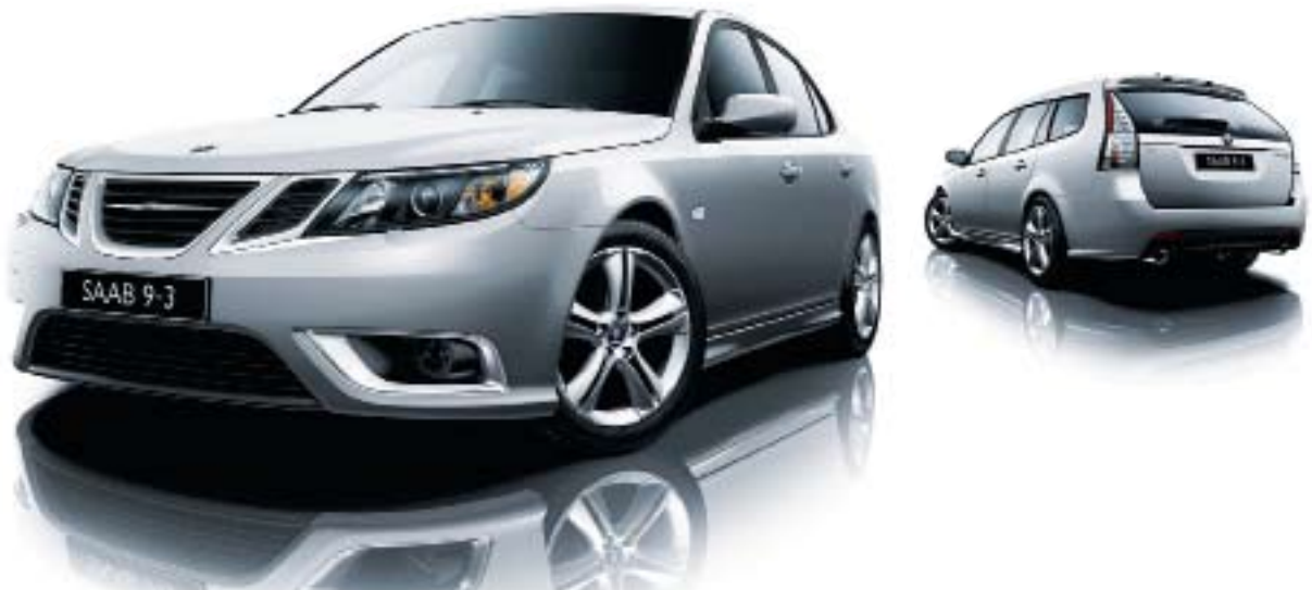
Saab 9-3 Aero Sport Sedan and SportCombi in Snow Silver Metallic. Shown with available equipment.

The Saab 9-3 is designed to feel more like flying than driving with its easy-to-read, intuitive controls and sporty, agile handling — not to mention an EPA estimated 29 MPG highway for 2.0T models. 1 And to help you keep up with an active family, the 9-3 SportCombi delivers incredible fuel efficiency 2 and offers more flexibility. Rear seats can be folded down, giving you the most cargo room in its segment. 3