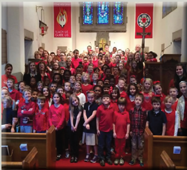
Celebrating Reformation Day