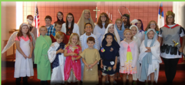
Our Savior, Fenton, celebrates 50 years with a giant cake and a week of festivities.