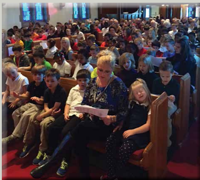
Grandparents' Day morning chapel

Word of Life Lutheran School in St. Louis, Mo., enjoyed a busy week at the end of October as 100 grandparents came to visit their little Cougars at the K-8 campus at Ascension Lutheran Church. Word of Life is an association of three local churches: Ascension, St. Lucas and Timothy.