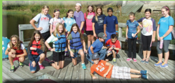
St. Mark's, Eureka, students at Camp MoVal and children enjoying Trunk or Treat.