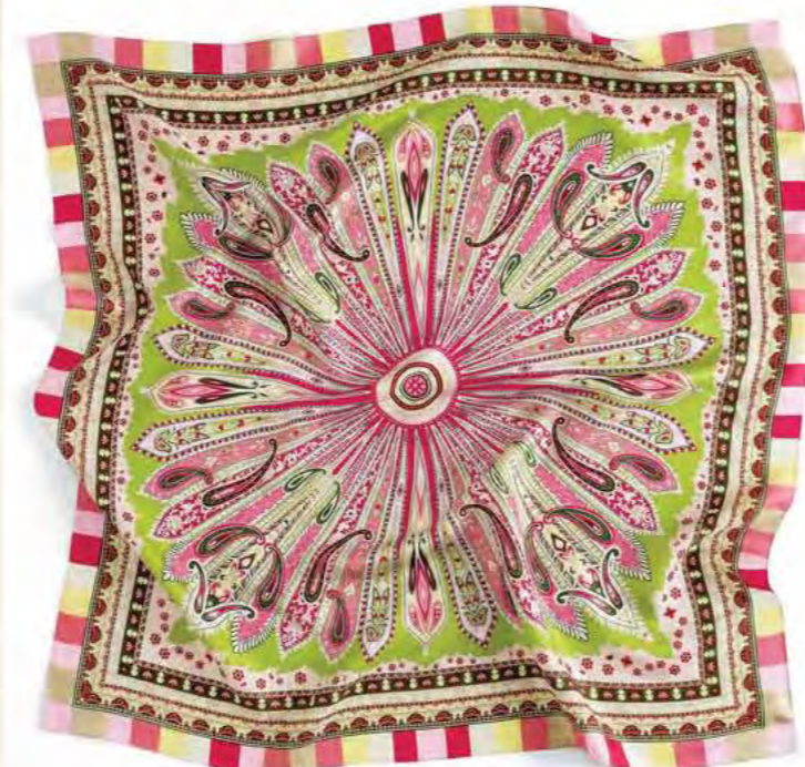
C. PEACOCK PAISLEY SQUARE 36" square. Silk twill. Dry clean. Imported. Tropical pink multi-29. C_48943 $59

E. LINEN CHECKED WRAP 20" x 80" with 3½" fringe. Dry clean. Imported. Cabana pink checks-88. In black checks on page 61. E_49943 $59