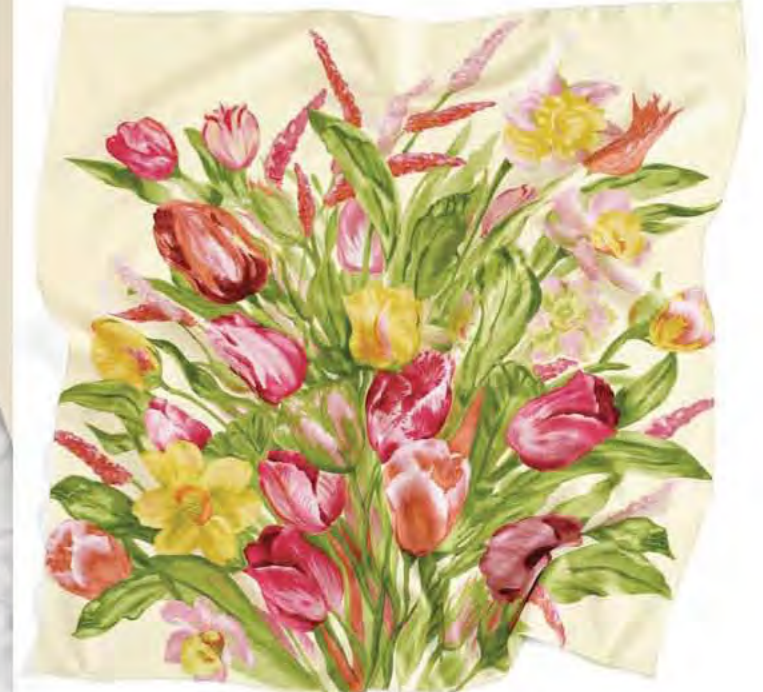
F. WATERCOLOR TULIP SQUARE 36" square. Silk twill. Dry clean. Imported. Ivory multi-89. F_49943 $59