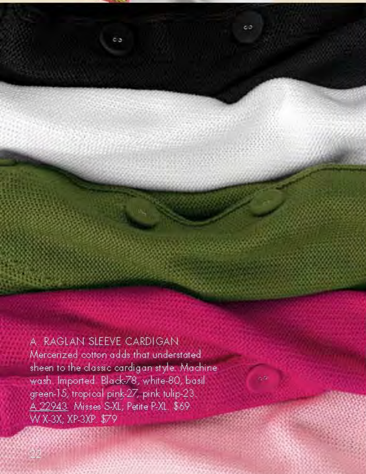
A. RAGLAN SLEEVE CARDIGAN Mercerized cotton adds that understated sheen to the classic cardigan style. Machine wash. Imported. Black-78, white-80, basil green-15, tropical pink-27, pink tulip-23. A 22943 Misses S-XL; Petite P-XL. $69 W X-3X, XP-3XP. $79