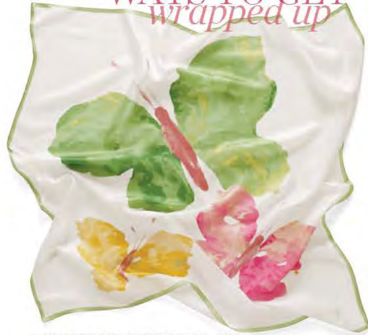
A. WATERCOLOR BUTTERFLY SQUARE 36" square. Silk gauze. Dry clean. Imported. Ivory multi-89. A_48943 $59