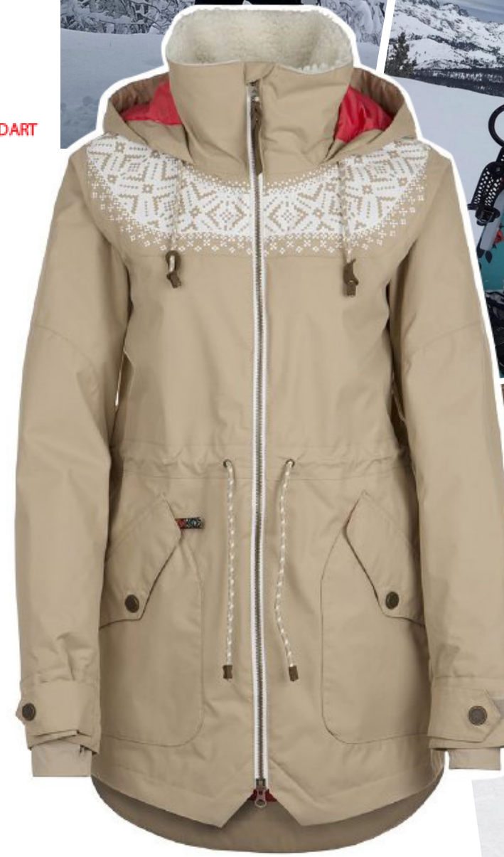
WINTER '15 MOUNTAIN THEME: PROWESS JACKET