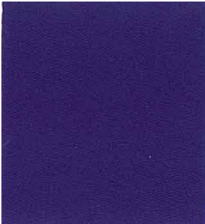
OMNI-SHIELD FLEX STRETCH WOVEN 86% Polyester, 14% Elastane DWR finish 54", 124 gms $2.99/yd