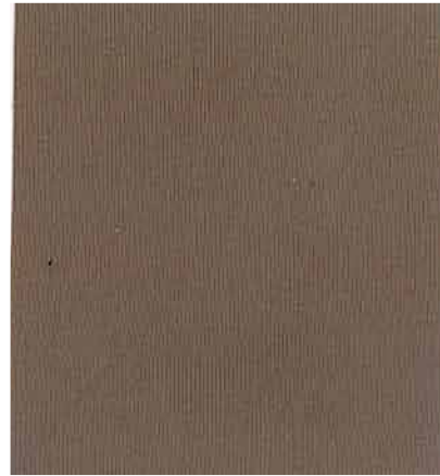
OMNI-FREEZE GEN 3 STRETCH 91% Polyester, 9% Elastane Freezer UPF50, Wicking + Anti-microbial 58", 144 gms, $3.45/yd