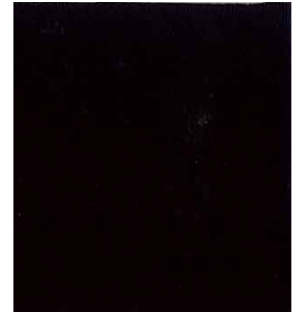
OMNI-WICK SANDED STRETCH JERSEY 85% Polyester, 15% Elastane UPF50, Wicking, Anti-microbial 57", 170 gms, $2.89/yd