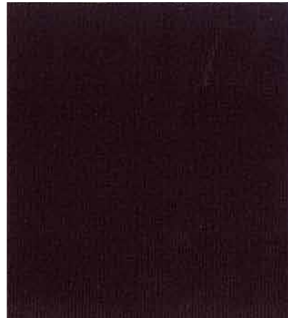
OMNI-WICK POLY JERSEY 92% Polyester, 8% Lycra Wicking Finish 62", 250 gms $3.10/yd