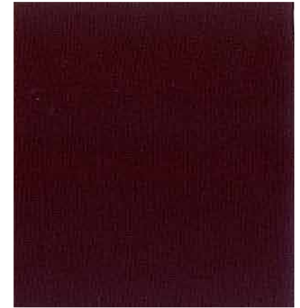
FLEX STRETCH WOVEN 86% Polyester, 14% Elastane UPF40, Omni-Wick 54", 124gms $2.66/yd