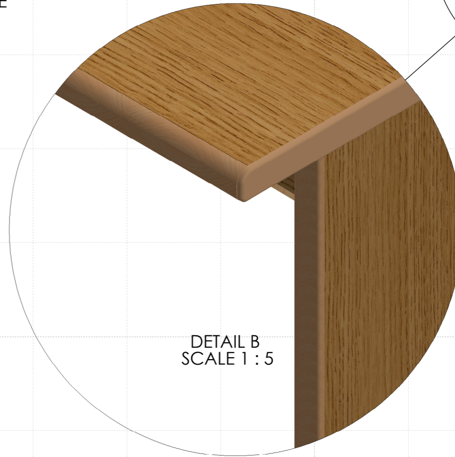
DETAIL B SCALE 1 : 5