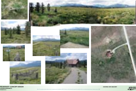
PRELIMINARY CONCEPT DESIGN ALIZADEH RESIDENCE

Conceptual site design for existing home. Seven acre site located a few miles down valley from Telluride Ski Resort in a Mountain Grasslands meadow. Windy site on plateau with 360 degree views overlooking the Wilson mountain range.