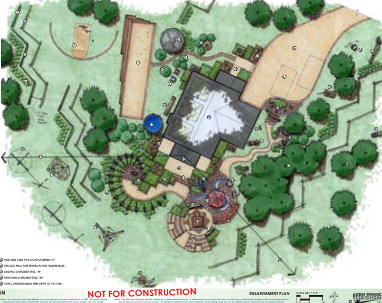
PRELIMINARY CONCEPT DESIGN ALIZADEH RESIDENCE NOT FOR CONSTRUCTION ENLARGEMENT PLAN SCALE 1/8" = 1'-0"

LEGEND EXISTING MOUNTAIN MEADOW PROPOSED 4' HC. SNOW FENCE (MATCH EXISTING) TYP. PROPOSED 4' HC. SNOW FENCE (WOOD AND METAL) TYP. EXISTING CONCRETE GATE TYP. BAMBOO MAT FLOOR CONCRETE COURT & STONE 3' POH LINE (ORNAMENTAL NATIVE VEGETATION SUBSTRANCE) SOCCER BALL COURT WITH LOW RETAINING WALL SLO STORAGE SHED SHED OR SMALL MOUNTAIN ORNAMENTAL TREE TYP. COMPOSTING BIN PERGOLA CISTERN FOR ROOFTOP RAINWATER HARVESTING MAIN ENGINEERING SCULPTURE SECONDARY ENGINEERING SCULPTURE EXISTING HANGING BERRY EXISTING HOME SOLAR PANELS ON ROOF EXISTING GRAVEL ENTRY DRIVE LARGE VEHICLE PARKING SPACES (10' X 20' APX) ONE CAR SCULPTURE RANCH FENCING SCULPTURE WAGON SCULPTURE WITH PLUMBER POSTS RECYCLED SNOWMOBILE SHED WIND TREE (10' DIA., 40' H) TYP. ARCHWAY (BRAND TUBULAR CHIMNEY 10' DIA., 20' H) WIND CHIME SCULPTURE STRUCTURE WIND SCULPTURE MOUNTAIN MEADOW GARDEN ENTRY GATEWAY (10' X 20' DIA.) FLANER WITH DECORATIVE PAINTING AND FAUX FURNITURE CHALK WALL (8' H) MOUNTAIN MEADOW GARDEN ALCOVE STONE FENCING SCULPTURE BRICK AND STICK PLANTING HANGING BERRY SCULPTURE AND PLUMBER CHALK WALL (LOW SEAT WALL 18" H) MOUNTAIN MEADOW GARDEN ENTRY GATEWAY MOUNTAIN MEADOW GARDEN ALCOVE STONE FENCING SCULPTURE BRICK AND STICK PLANTING HANGING BERRY SCULPTURE AND PLUMBER CHALK WALL (LOW SEAT WALL 18" H) VIEW CORRIDOR (DEAL WITH VIEWS TO THE SCEN)