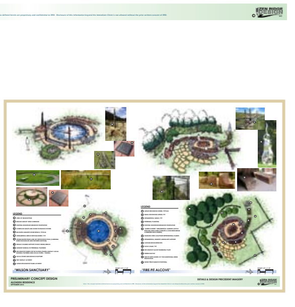
PRELIMINARY CONCEPT DESIGN ALIZADEH RESIDENCE DETAILS & DESIGN PRECEDENT IMAGERY