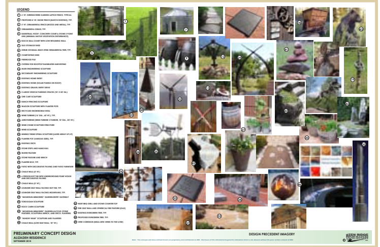
DESIGN PRECEDENT IMAGERY