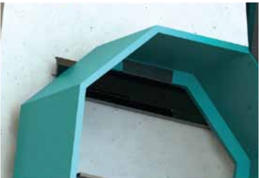
hanging shelf brackets can slide along rail to move large shelves easily