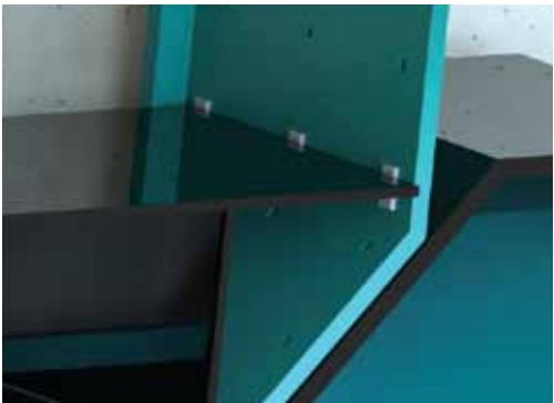
pegs allow inside shelves to adjust