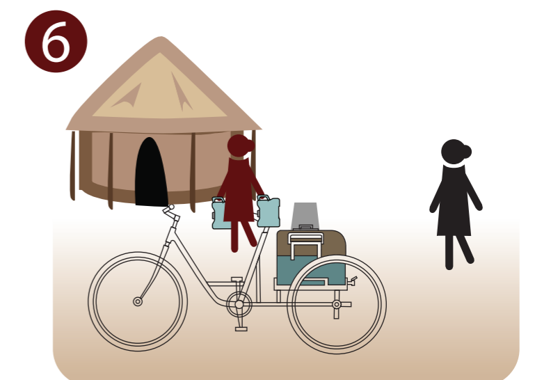
6 The next user comes to do the same journey.