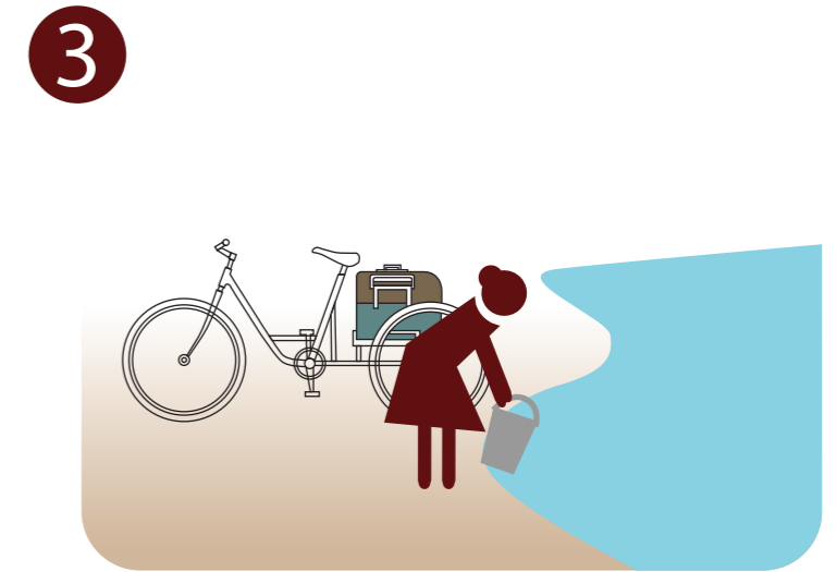
3 The user removes the water bucket and starts filling it and adding it into the Ayaan. She will need to fill up 3 water buckets to fill up the Ayaan, after she heads back home.