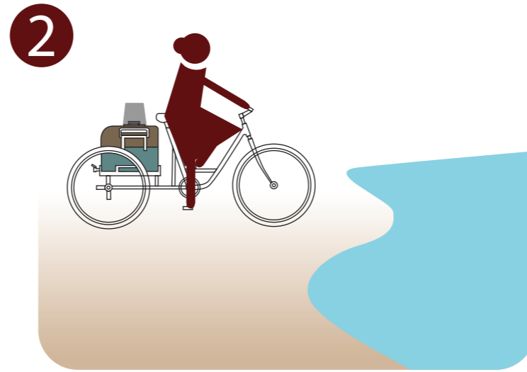
2 The user arrives to the water source which is a pond.