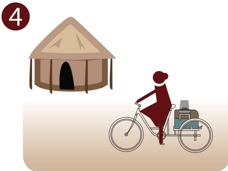
4 The user arrives home. It only takes 20 minutes of cycling to filter the 50l of water.