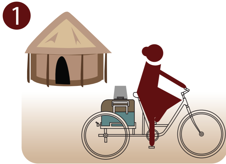
1 The user leaves home to get to the nearest water source.