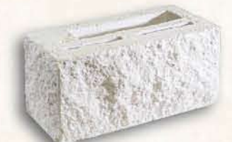
Universal Corner 8" x 8" x 16" (applicable for 4", 8" & 12" walls)