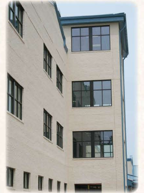
Right Top: East Millbrook Middle School, Raleigh, NC Designer Collection™ Brick, Split Face, Custom Cream