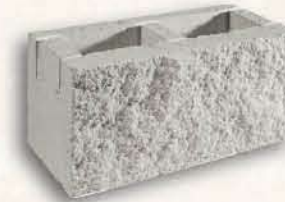
Bond Beam (Knock-Out) 8" x 8" x 16"