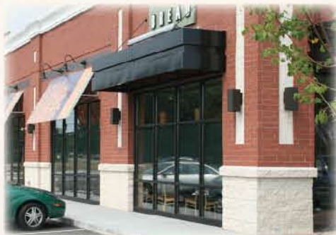
Below: Panera Bread, Richmond, VA Split Face, Cream