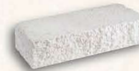
Flat Sill Unit 6" x 4" x 16"