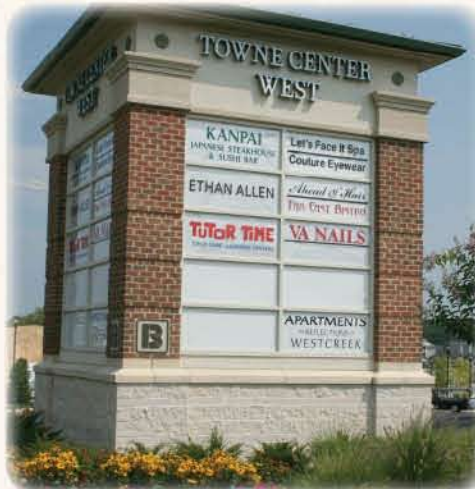
Above: Towne Center West, Richmond, VA Split Face & Ground Face, Cream