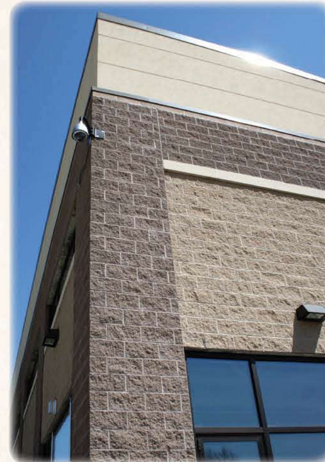
Above: Manheim Township High School, Lancaster, PA Split Face, Cocoa & Sandstone