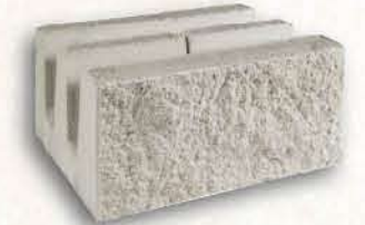
Bond Beam (Solid-Bottom) 12" x 8" x 16"