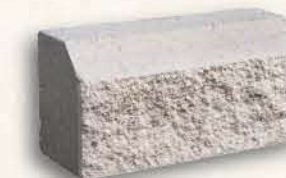
Beveled Sill Unit 6" x 8" x 16"