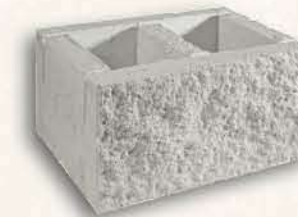
Bond Beam (Knock-Out) 12" x 8" x 16"