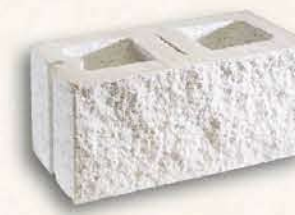
Hollow Stretcher 8" x 8" x 16"

Solid end core for easy splitting of corners in the field.