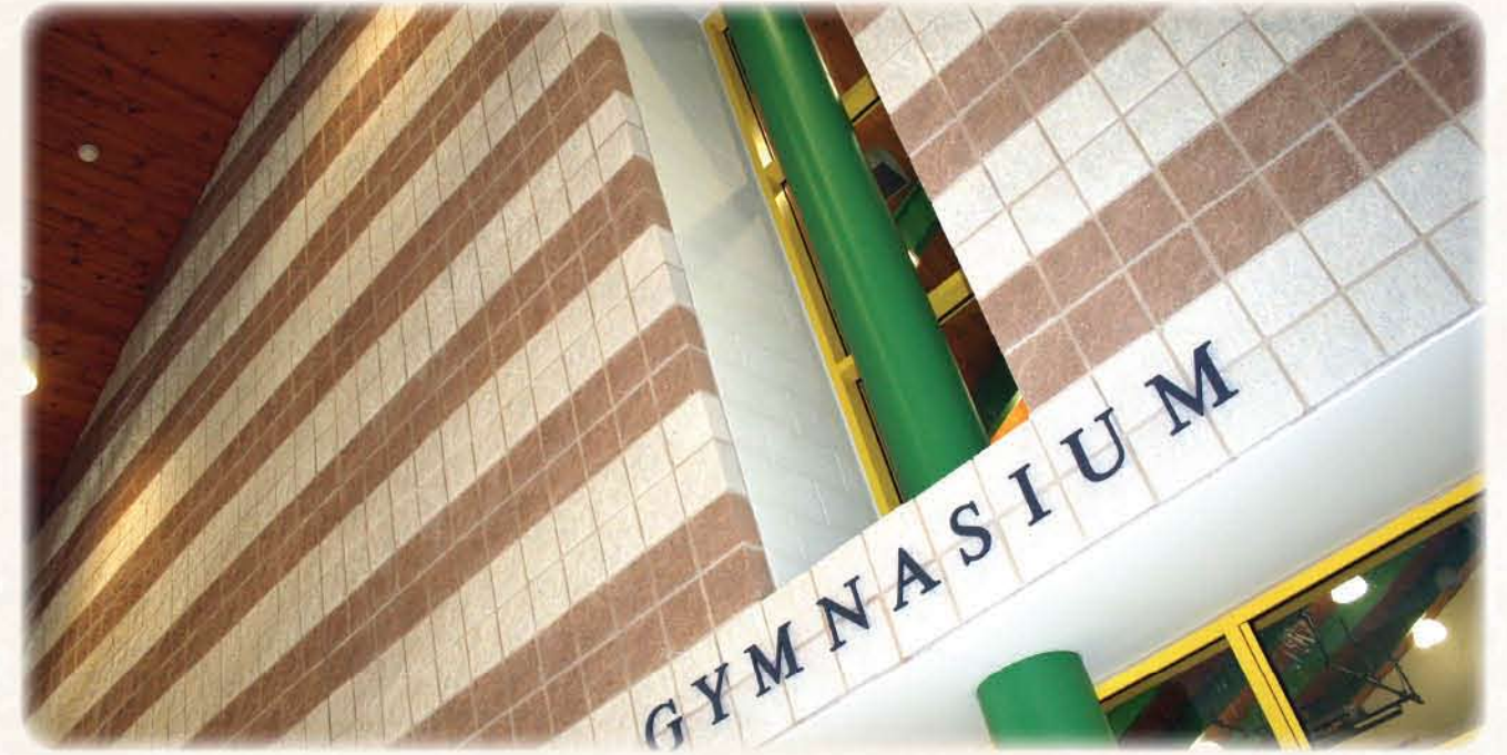
Below: Monocacy Elementary Center, Douglassville, PA Split Face, Custom Cream & Nutmeg