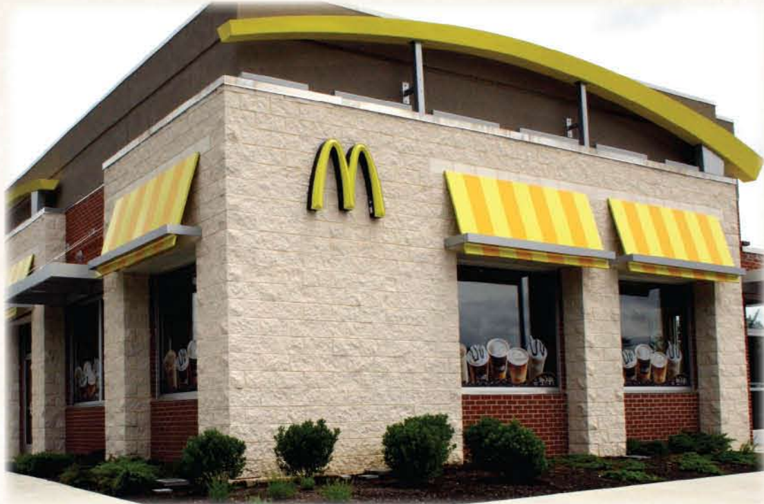
Left: McDonalds, Brick, NJ Split Face, Cream