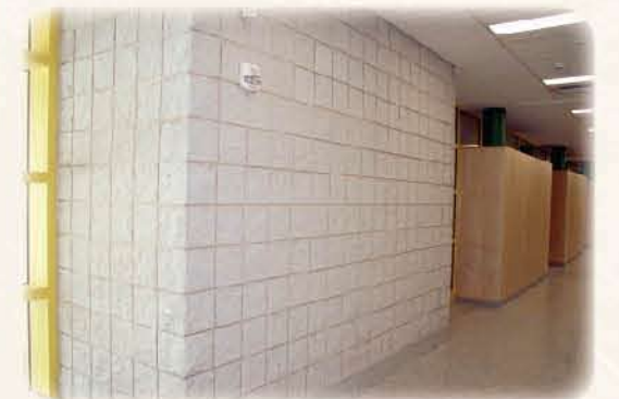
Right Bottom: Monocacy Elementary Center, Douglassville, PA Split Face, Custom Cream