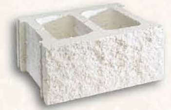
Hollow Stretcher 12" x 8" x 16"