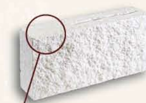
Hollow Stretcher 4" x 8" x 16"

All 12 STOCKED Split Face colors are provided in the following ten shapes for quick delivery.*