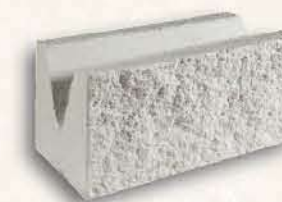
Bond Beam (Solid-Bottom) 8" x 8" x 16"