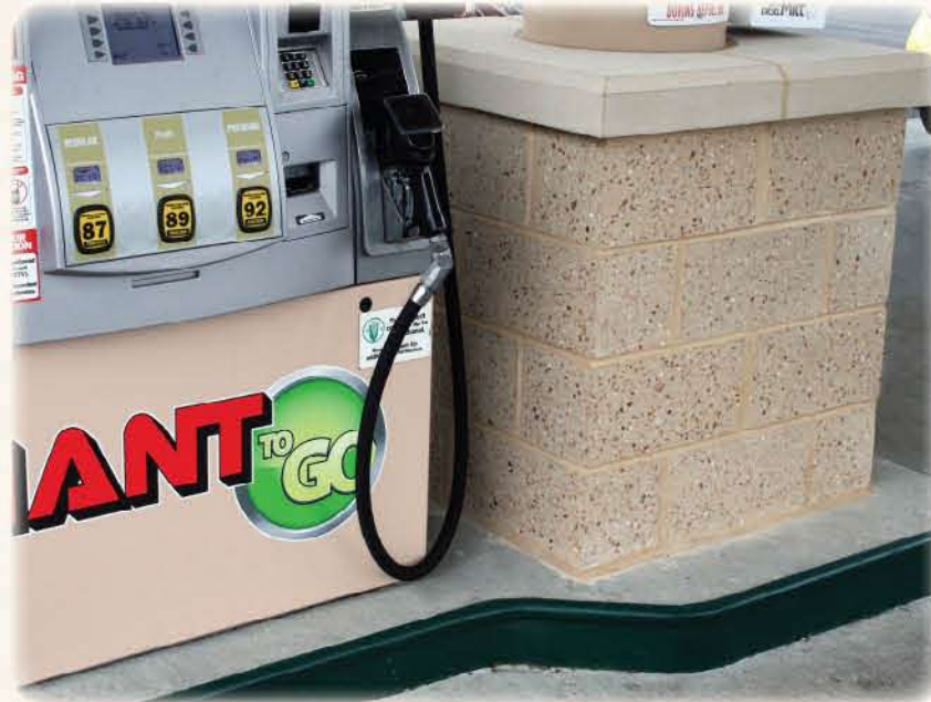
Above: Giant-To-Go, Lancaster, PA Ground Face, Custom Tan