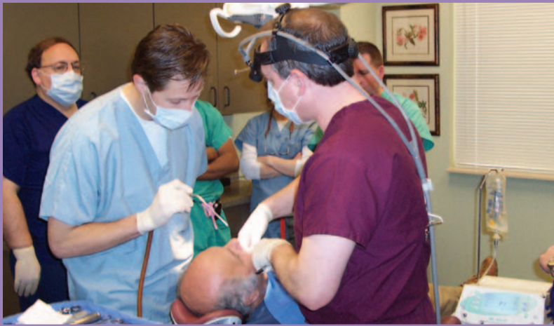
A practical, predictable and conservative approach to implant dentistry.

We see the tremendous opportunity to change implant dentistry throughout the Southeast and we are confident that with your support and partnership - we can!