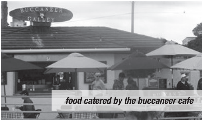
food catered by the buccaneer cafe