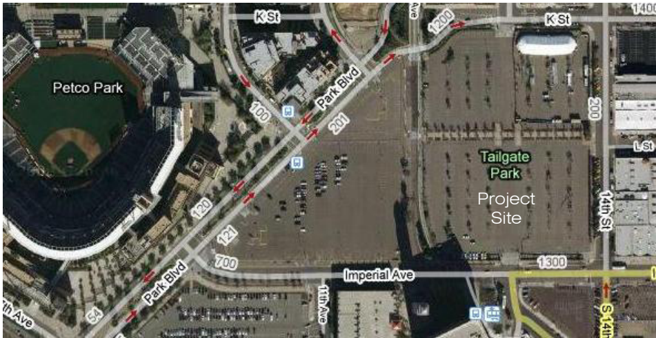
PETCO Park Parking Lot - San Diego, Google Aerial Map

"Taking Back the Land" takes over a block of the Padres' PETCO Park parking lot and redesignates it as a public restroom, soup kitchen, and housing for the homeless. Incorporated in the plan is a water feature that connects San Diego's public trolley system with the project. The rooms, designed to fit inside a single parking space, are for rent at $3 a day, as it would be to park a vehicle in the lot during the off-season.