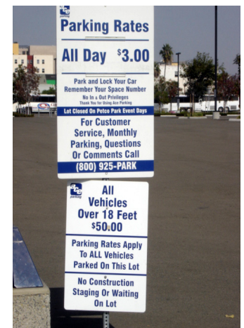
Site Visit - $3 Parking, 2007, Site Photograph