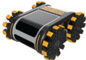
Close to wall cleaning