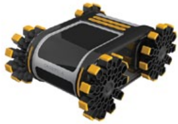
Fast ground coverage