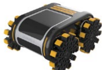
Ability to climb stairs