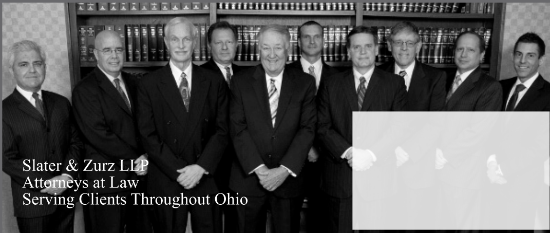
Slater & Zurz LLP Attorneys at Law Serving Clients Throughout Ohio

Call us for a FREE Consultation 1-800-297-9191 www.slaterzurz.com