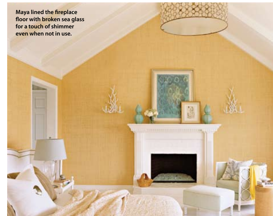
Maya lined the fireplace floor with broken sea glass for a touch of shimmer even when not in use.

The busy parents make sure to keep some spaces reserved just for adults, like the living room, which Langka admits is not kid-friendly on purpose. Its sophisticated furnishings, while not suitable for art projects or snack time, serve well for book club gatherings and catching up when friends drop by. While juggling busy schedules and taking care of their newest addition, a 2-year-old Ethiopian girl who arrived mid-January, the Treadwells find peace in their everyday coastal retreat. "We love being together in our home," Langka says. "It's like we live on our own divine island." ■ Sources: page 113