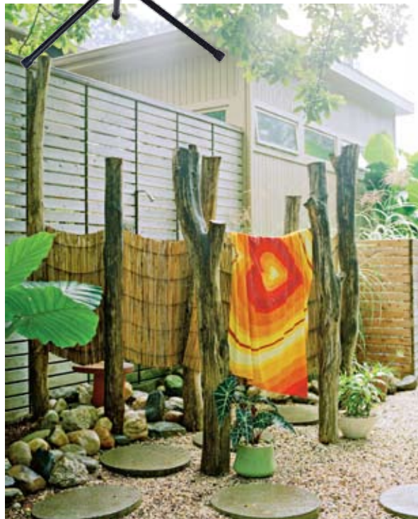
The Retro Bullet Planter in Hot Orange, $145 (16"); hiphaven.com

PLANT BOLDLY "I LOVE A GIANT ORANGE PLANTER! I'M ALWAYS ON THE LOOKOUT FOR COLORFUL POTS THAT COMPLEMENT JONNY'S CERAMIC SHAPES" —SIMON