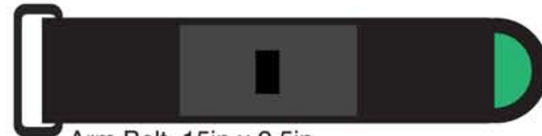
Arm Belt 15in x 2.5in