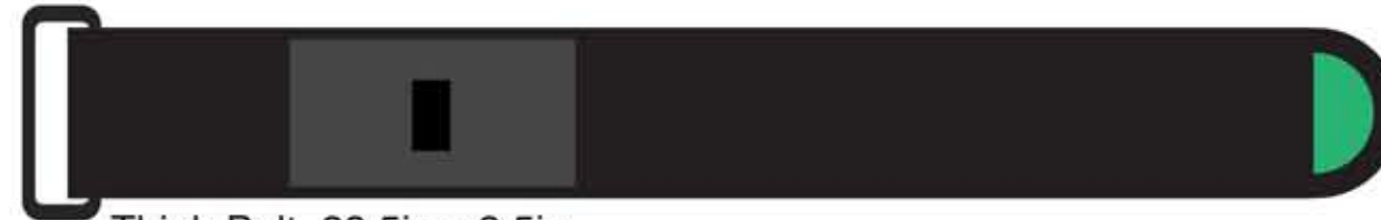
Thigh Belt 22.5in x 2.5in