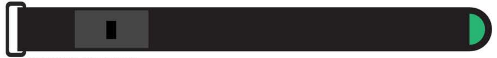
Waist Belt 27in x 2.5in