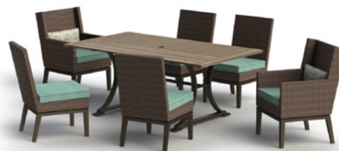
ROBERTS 7-Pc. Dining Set, woven cushioned

Across the board, accessories will be the main way that consumers add personal touch to their outdoor spaces.