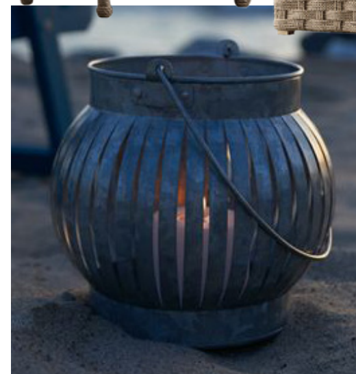
This whimsical lantern adds lots of character to a set.