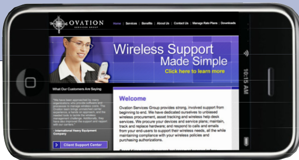
At home or on the go, visit us at www.OvationWireless.com

Expense Management - Cost reduction through rate plan optimization, followed by monthly wireless analysis, reporting, and management.