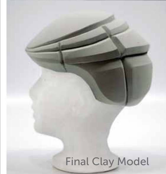
Final Clay Model