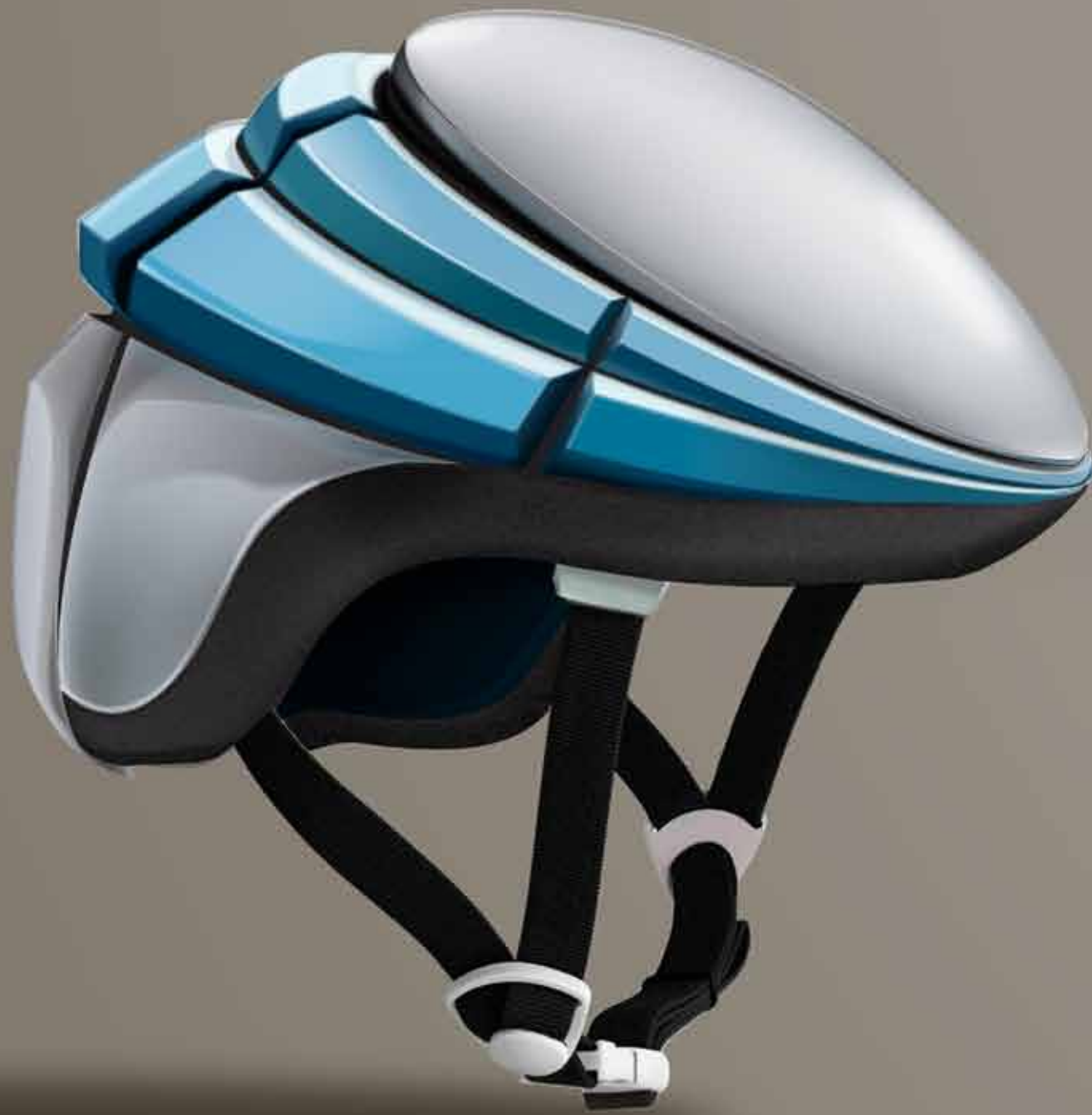
Adobe Illustrator Rendering