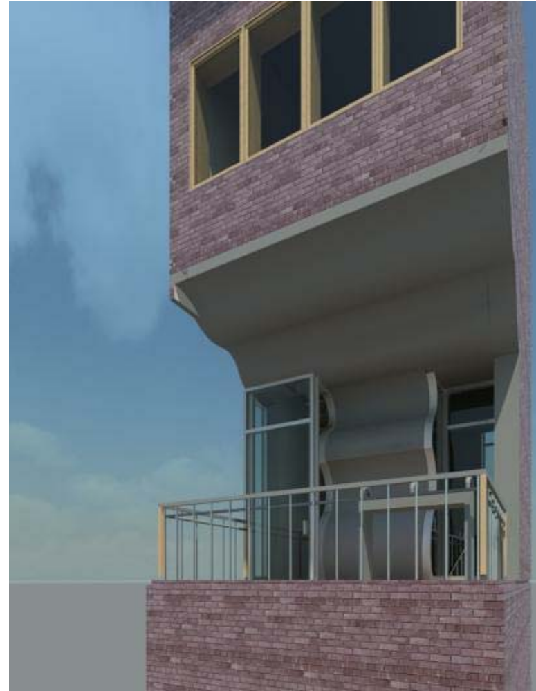
② Exterior Rendering 6" = 1'-0"