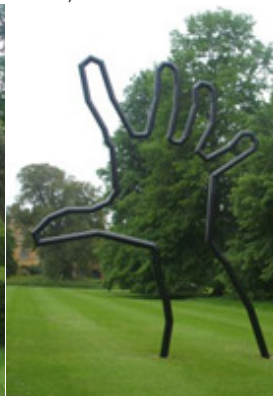
Untitled (The Thing) by Piotr Uklanski, 2008