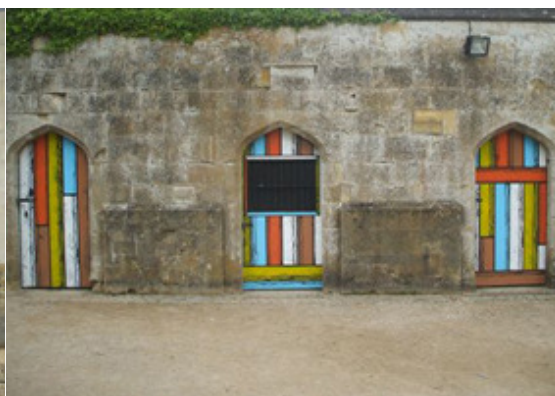
Lifestyle Sculpture #1-5 by Richard Woods, 2008