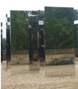
Simplified Mirror Labyrinth 1 by Jeppe Hein, 2008