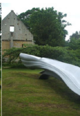
Z-Stream by Zaha Hadid, 2008