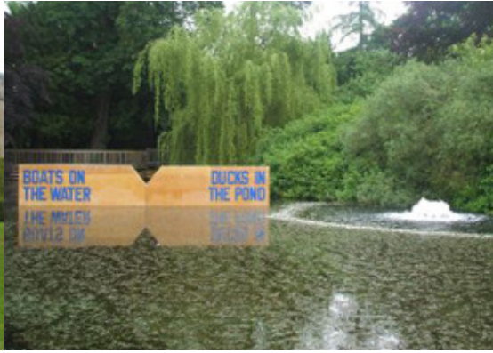
On The Water: In The Pond by Lawrence Weiner, 2008