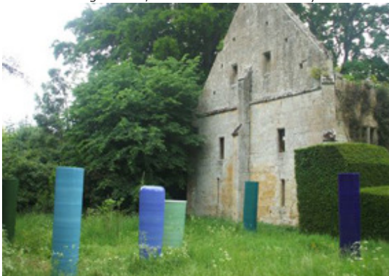
Pillars by Ai Weiwei, 2006-2007