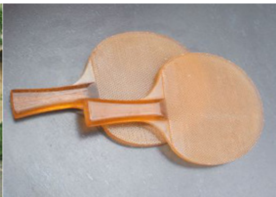
A Level Playing Field by Rolf Sachs, 2008