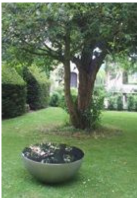
Moon Table 90 by Arik Levy, 2008