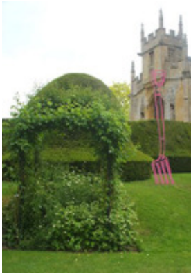
Sudeley Pitchfork by Michael Craig-Martin, 2008