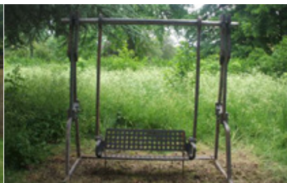
Chair, Swing, Chaise, Table by Tom Dixon, 2008