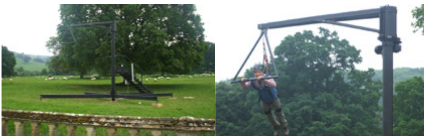
Flying Machine by Carsten Holler, 2008

Jeppe Hein's mirrored labyrinth supplies multiple views of the surroundings reflected in its walls. Carsten Holler has created The Flying Machine , an installation which involves a volunteer being strapped into a mechanical contraption that swings through the air. And to appreciate James Hopkins' sculptures you have to look through a kaleidoscopic telescope.