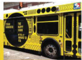
the happy slow marketing