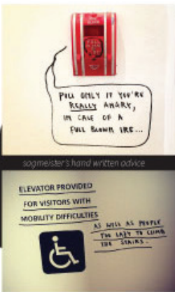
sagmeister's hand written advice