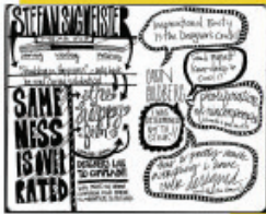
sagmeister's life advice

COMPLAINING IS SILLY. EITHER ACT OR FORGET. ~ STEFAN SAGMEISTER