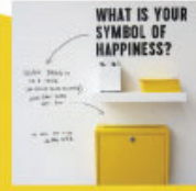
what's your happiness