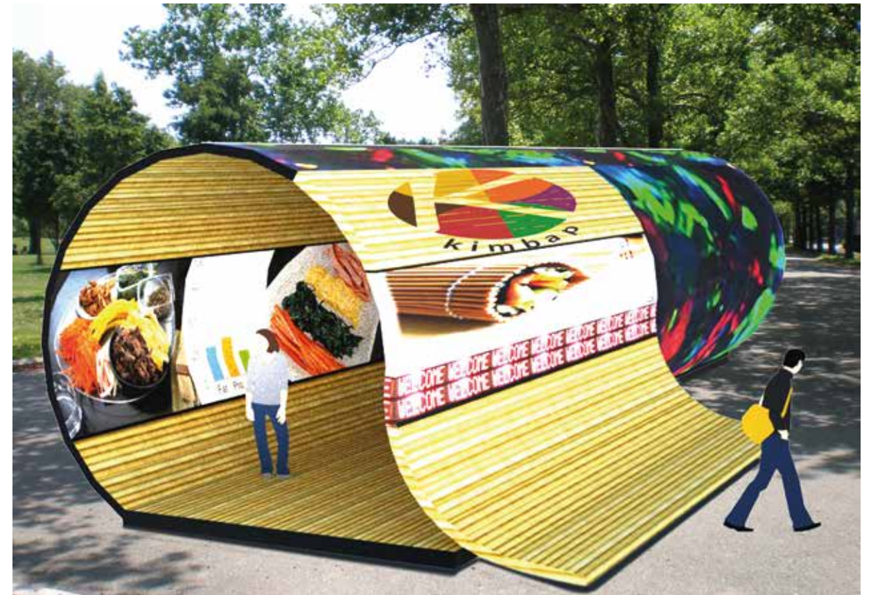
Kimbap Exhibition in Flushing Meadows Corona Park