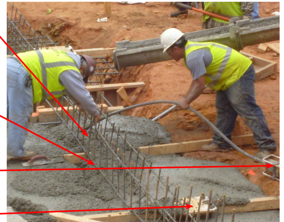
Observation of Form Liners and bracing