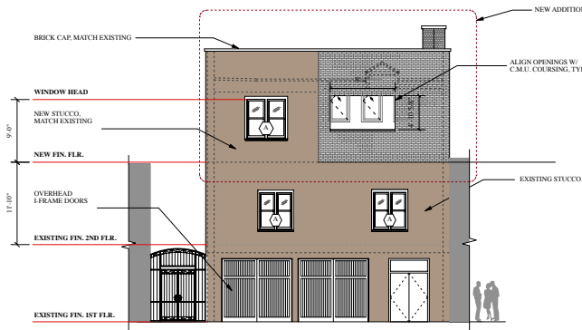
3 NORTH ELEVATION SCALE: 1/8" = 1'-0"