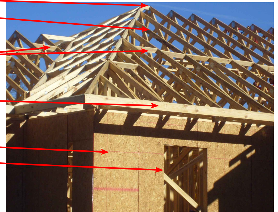
Observation of Roof Framing Condition