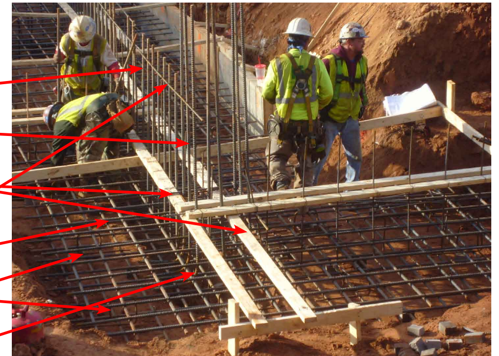
Observation of Form Liners before pouring