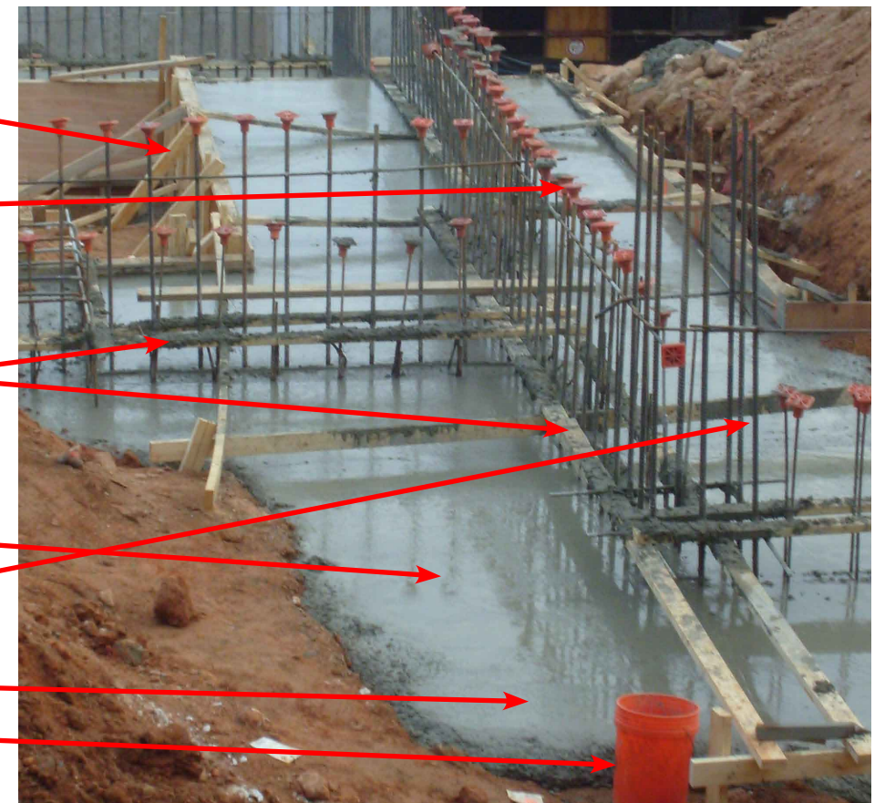
Observation of Recently Poured Concrete