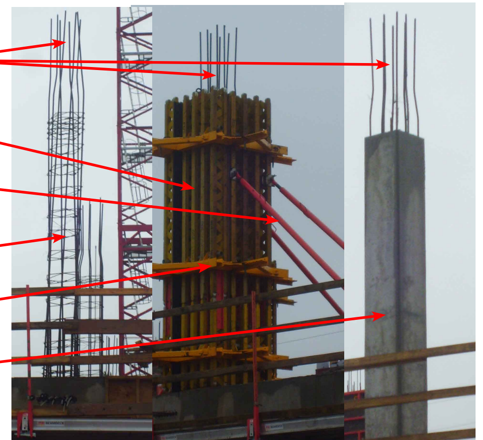
Observation of Square Column Construction Process