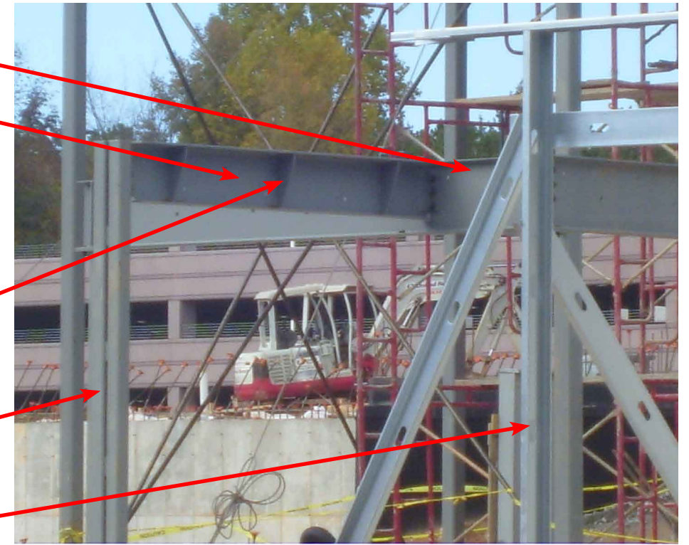
Observation of Steel Construction Condition