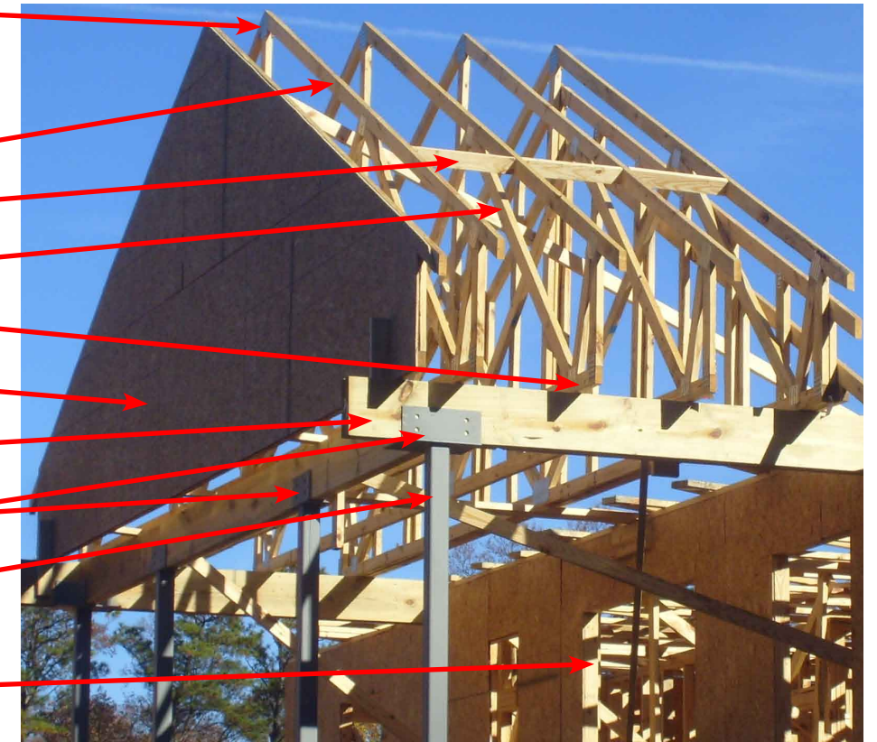
Observation of Front Gable Truss System