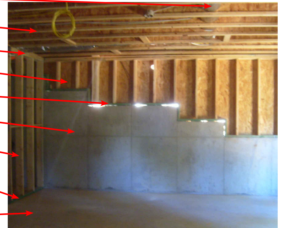
Observation of Foundation Wall system and how it steps down to create basement condition