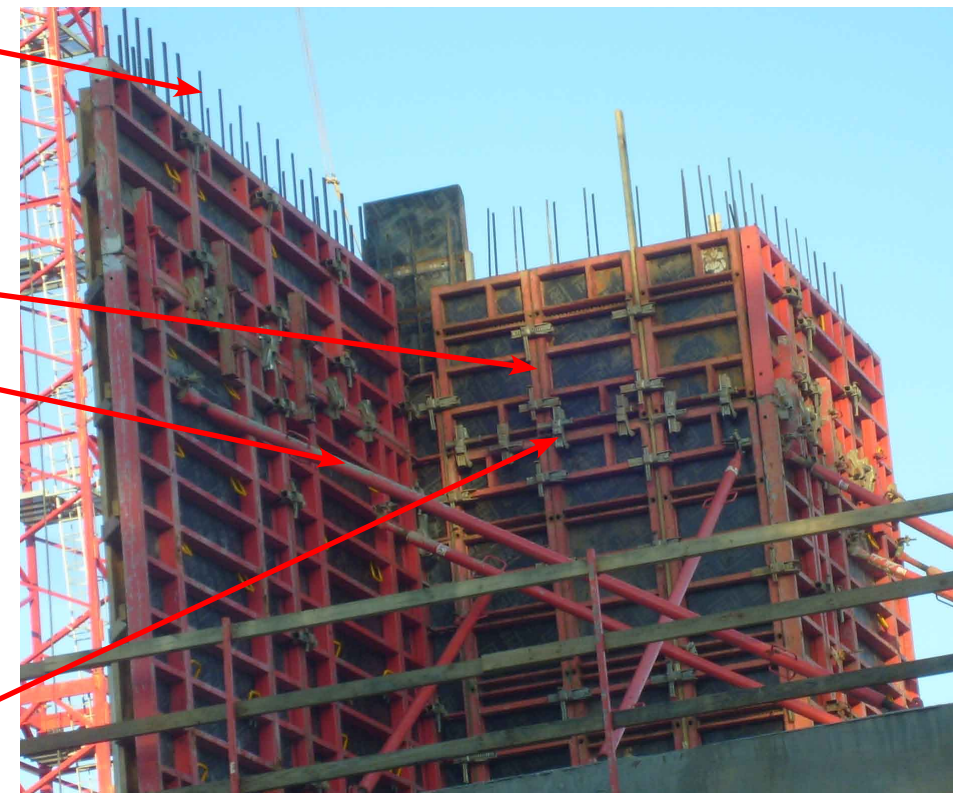
Observation of Form Liners and bracing