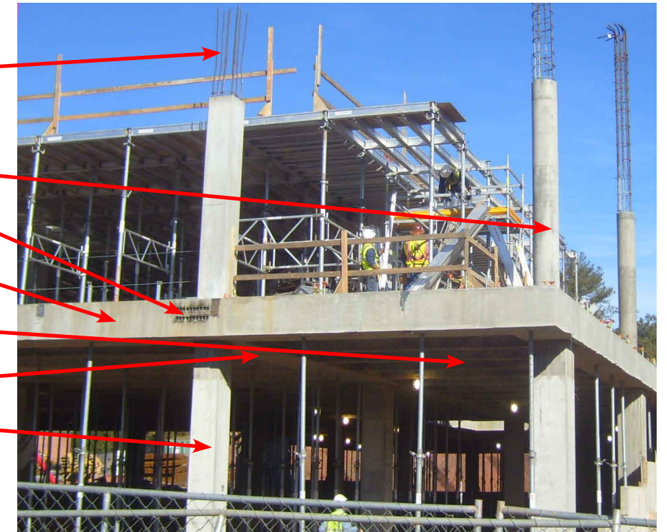
Observation of Concrete Columns and Slab