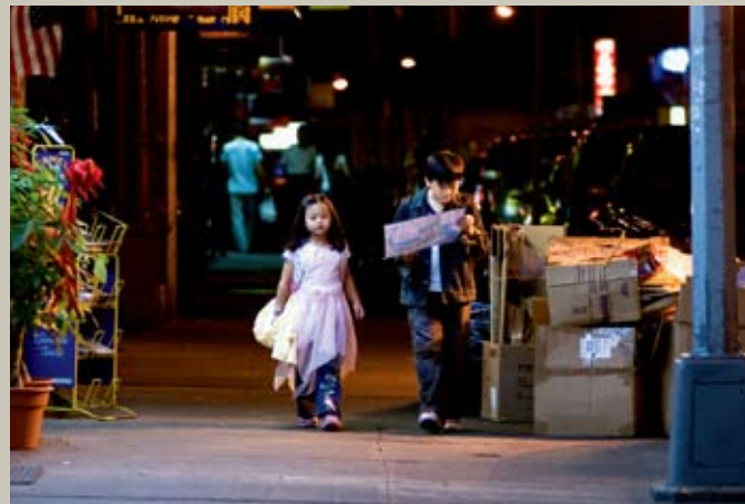
October 26 Children of Invention