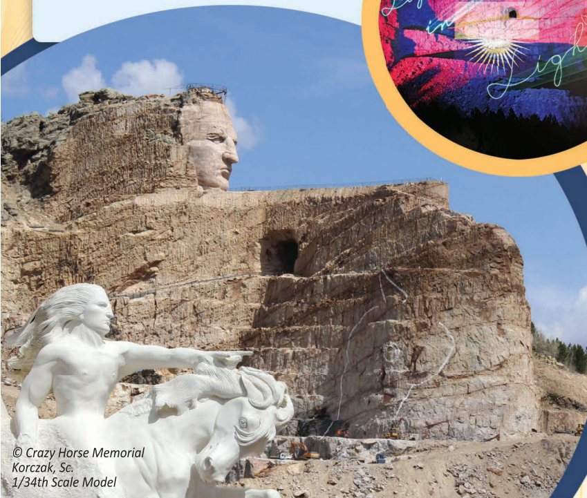
© Crazy Horse Memorial Korczak, Sc. 1/34th Scale Model