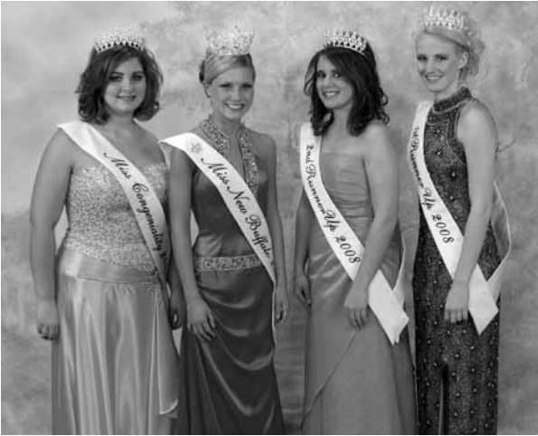
2008 Court of Honor