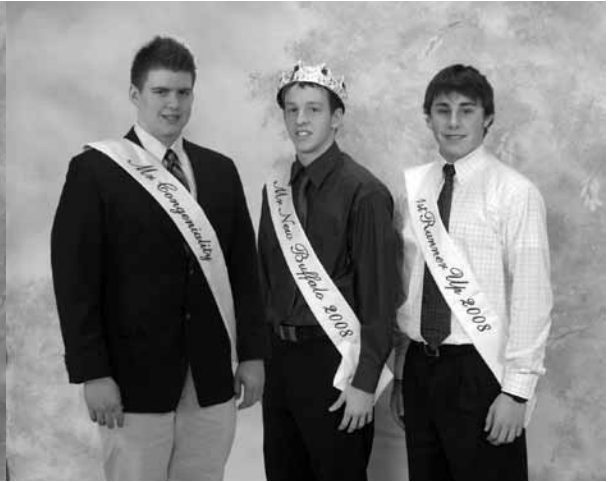
2008 Court of Honor