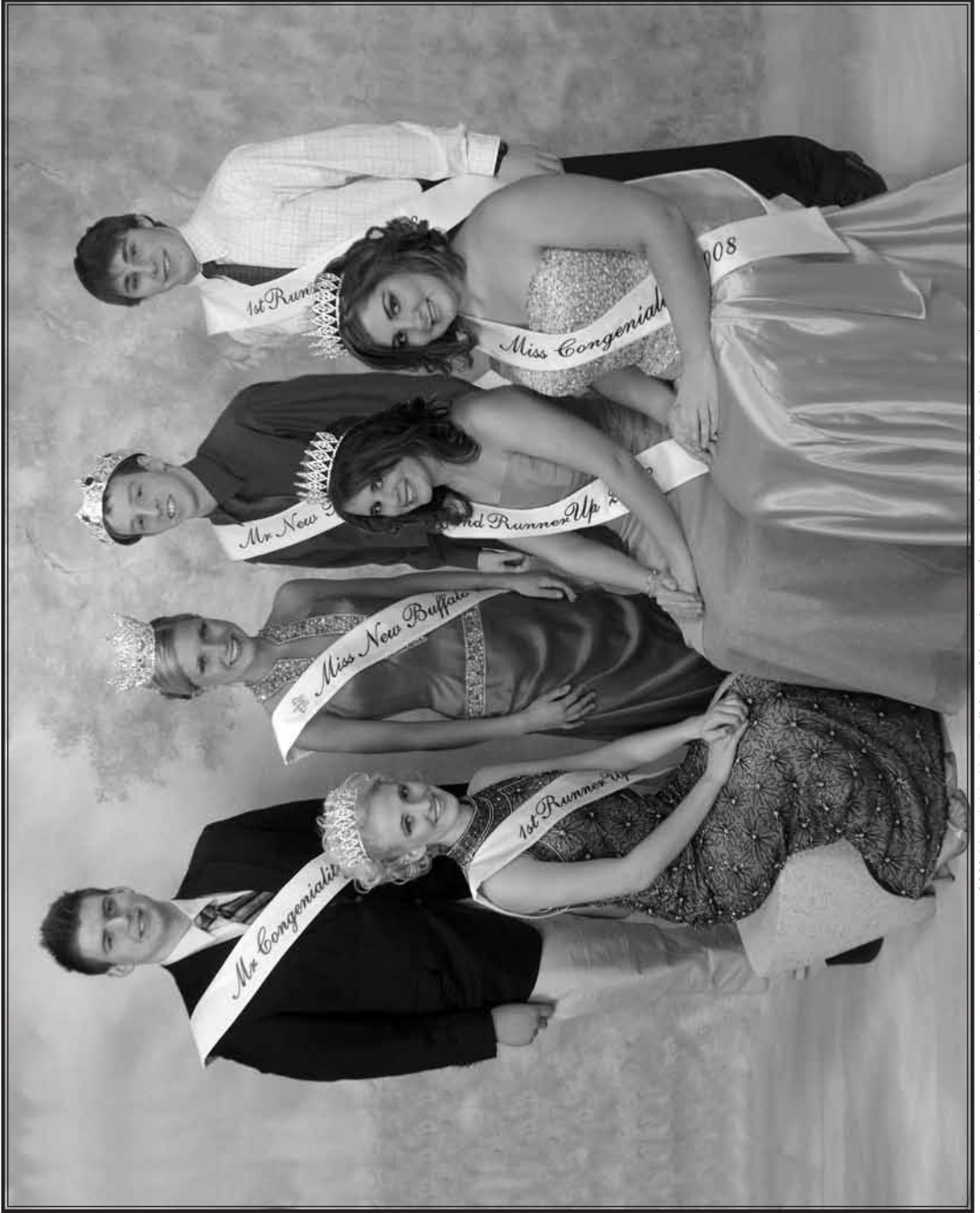
2008 Miss & Mr. New Buffalo and their Courts