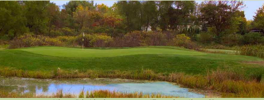
"Alcatraz" the island green...can you "Escape from Alcatraz?"

to book your group's tee time and to find out how you can play!