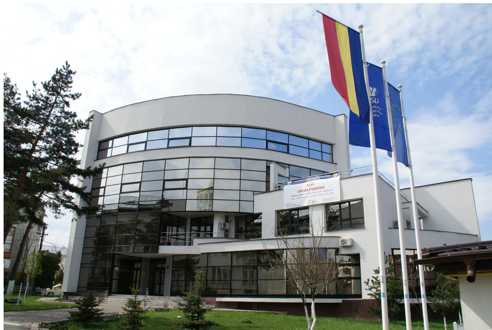
Main Building - H

The faculty also offers 6-12-month Postgraduate training courses.