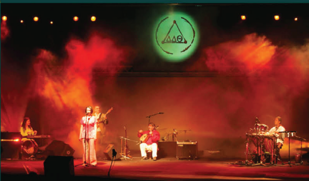
The Key, The sound code of eternity

Most important towns and festivals in Macedonia: Skopje, Ohrid, Bitola, Kavadarci, Prilep, Delcevo, Kumanovo, Stip, Strumica, Veles, Struga etc.