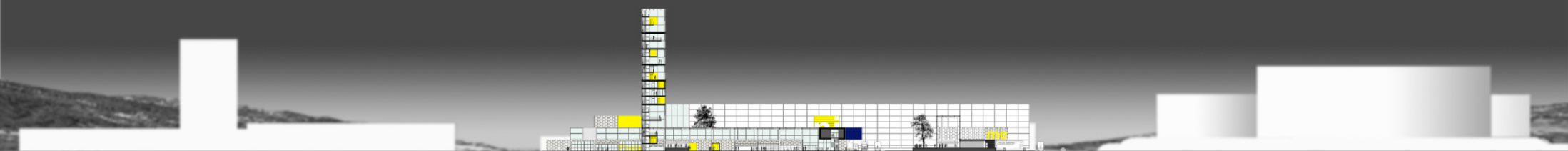
GG' section 1:500