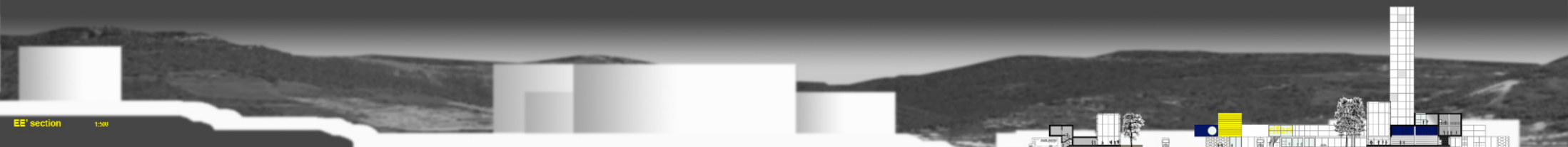
EE' section 1:500