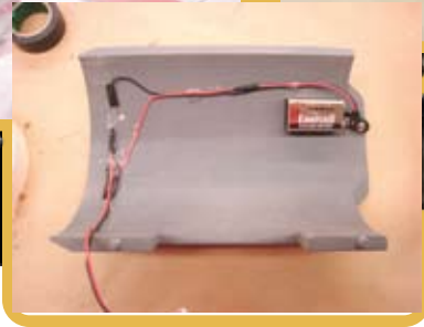
WIRING AND SODERING