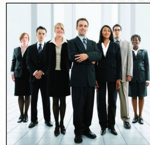
e-Discovery Review Center