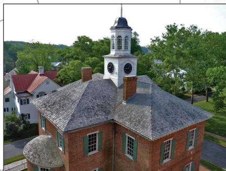
Chowan County Courthouse Edenton, NC