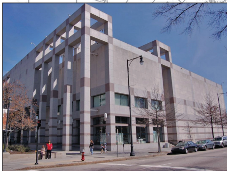
NC Museum of History Raleigh, NC