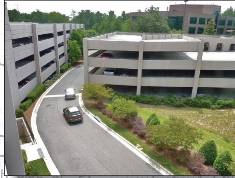
Forum Parking Decks Raleigh, NC