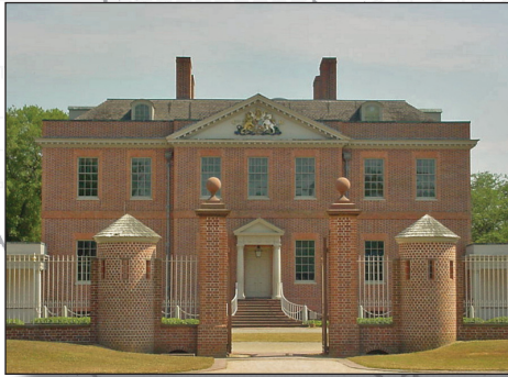
Tryon Palace New Bern, NC

Our staff is experienced across a variety of structures and challenges. These examples illustrate the diversity of our projects.