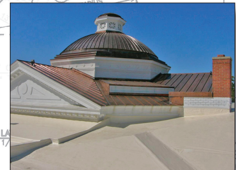
First Baptist Church Clayton, NC