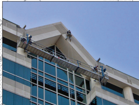
Tower One Raleigh, NC