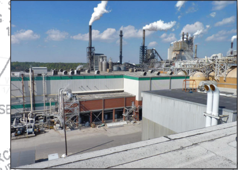
International Paper Riegelwood, NC