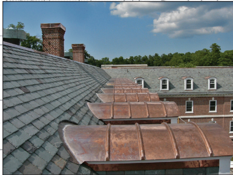
Wilson Residence Hall Durham, NC