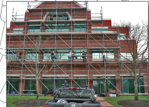
Colonnade Building Richmond, VA