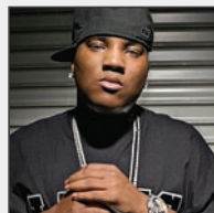
Young Jeezy Album: Thug Motivation 103 Release Date: 2/9/10