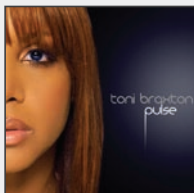
Tony Braxton Album: Pulse Release Date: 2/2/10

Get ready to fill those MP3 Players. Check out this list of albums to watch out for this Winter.