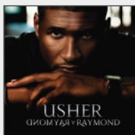
Usher Album: Raymond v. Raymond Release Date: 2/16/10