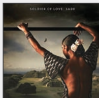
Sade Album: Soldier of Love Release Date: 2/8/10