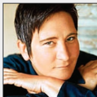
K.D. Lang Album: Recollection Release Date: 2/2/10